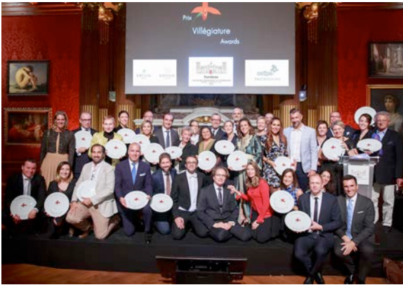
All the 2018 Prix Villégiature award winners