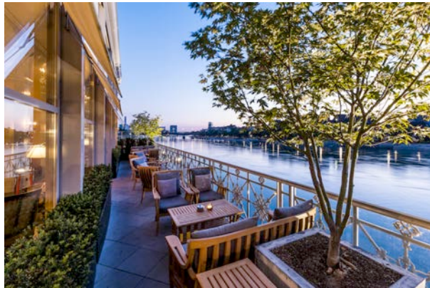
The terrace of the Grand Hotel Les Trois Rois