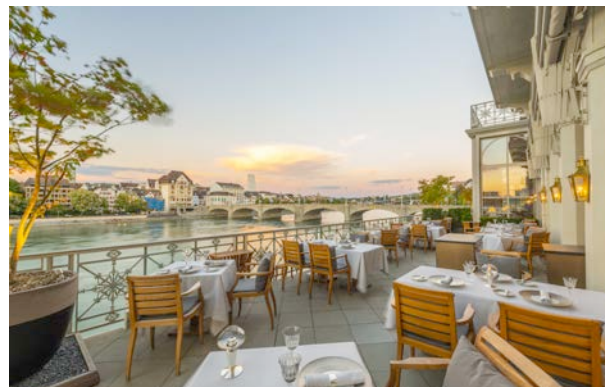
The terrace of the 3 Michelin star Restaurant Cheval Blanc by Peter Knogl

Grand Hotel LES TROIS ROIS Blumenrain 8 | CH-4001 Basel | Switzerland T +41 61 260 50 50 | F +41 61 260 50 60 | info@lestroisrois.com www.lestroisrois.com