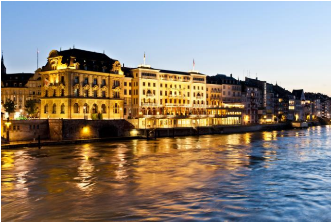
Grand Hotel Les Trois Rois